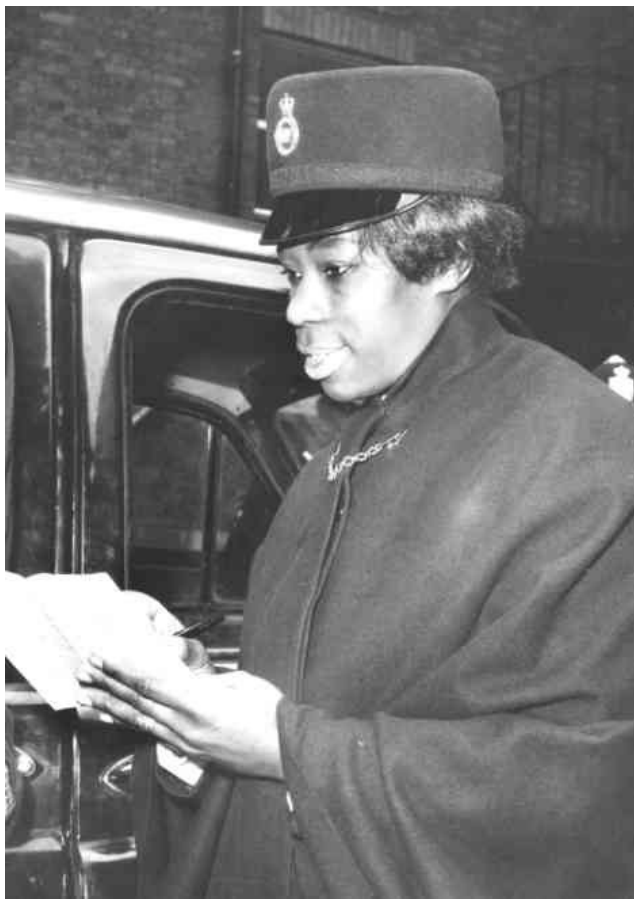
Sislin Fay Allen

Sislin Fay Allen was an inspiration for many when she became the Metropolitan Police's first black female police officer. Jamaican-born, Sislin joined the force in 1968 being deployed to Croydon.